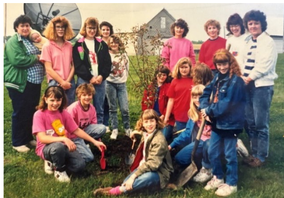
Club planting a tree at the County Home